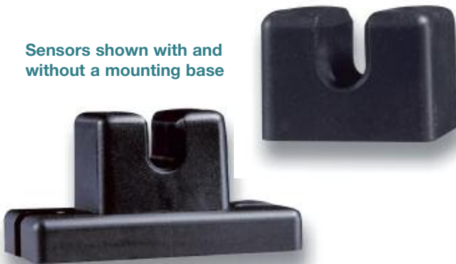
Sensors shown with and without a mounting base

Introtek BDF (for soft tubing) and BDP (for rigid tubing) sensors are available with or without a mounting base. The BDF sensor is constructed of either rigid epoxy or ABS plastic and the BDP sensor is constructed of soft polyurethane.