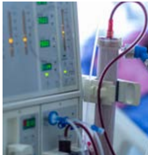
Miniature Air Bubble Sensor (MABS)