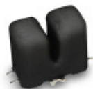
STANDALONE CHIP-LEVEL INTEGRATION (ACTUAL SIZE)

INTROTEK® miniaturized sensors incorporate the latest generation of pulse-type ultrasonic circuitry. Each sensor is built to INTROTEK unsurpassed quality and is 100% factory-tested before shipment. As a value-added provider, INTROTEK will integrate special components to supply custom sensor package.